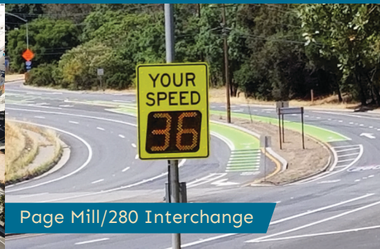
Page Mill/280 Interchange